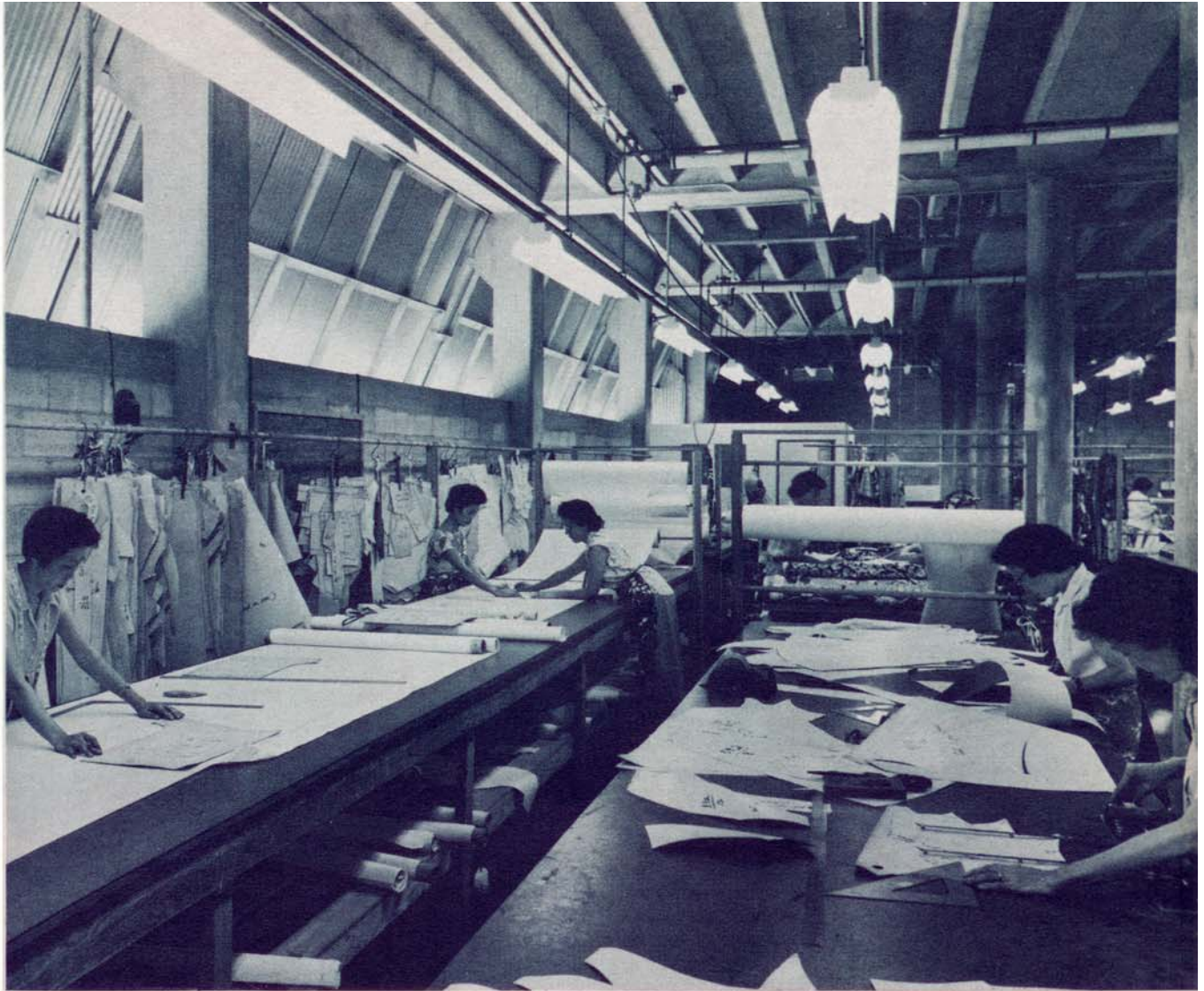
Workers trained by Shaheen cut out garment designs in the cutting room. As many as 700 layers of material are sometimes cut at one time.